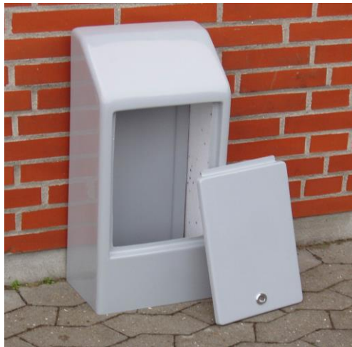
Cabinet type 2.