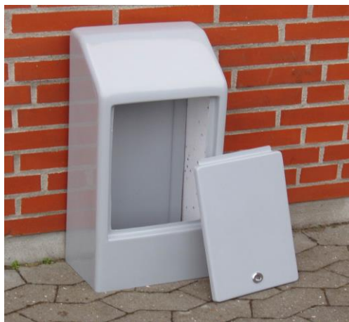
Insert Cabinets type 2.