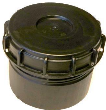
Waterproof screwcap and frame

The waterproof screw caps are available in 3 types and protect the district heating valves against rainwater, moisture, salt and dirt, including brake dust, which means easier operation and longer service life.